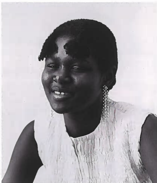
TOP, £1,350, BY JIL SANDER BY LUCIE AND LUKE MEIER. EARRINGS, PRICE ON REQUEST, BY VAN CLEEF & ARPELS, SEE PAGE 174