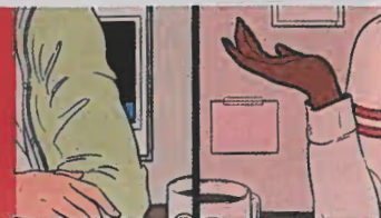
Top to bottom: illustration by Mari Fouz; photograph by Andres Gonzalez; illustration by Nicole Rifkin; illustration by Violet Reed

P. 88 Very Short Stories by WIRED readers