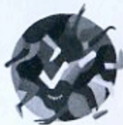
Eikanodata ( Barcelona, Spain)

The Drasik Studio is an independent multi-disciplinary design studio based in Barcelona, Spain since 2009. It specialises in all kinds of creative solutions, from graphic design and illustration to animation and art direction. It has worked for clients such as Adidas, Damm, Audi, P&G, Nike Global, Dewar's White Label, Infrinti, Seat, Honda and Antonio Puig Perfumes among others.