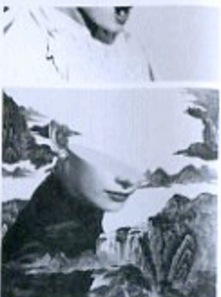
Kayankwok (Hong Kong)