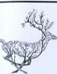
ed Basha nce, Italy)