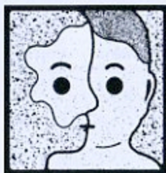
Icinori ( Paris, France)