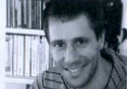
BlindSalida (Nîmes, France)

anthonyneildart.tv ontwerp.tv gram.com/anthonyneildart