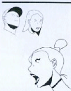
Kadavre Exquis (Paris, France)

London-based illustrator Josh McKenna uses asymmetric layouts, seductive curves and often oversized characters to create a world with a strong, distinctive colour palette. Inspired by sunny coastal scenes.