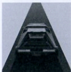
Facultative Works ( St. Petersburg, Russia)

Eikanodata is a global information- design agency based in Barcelona, Spain, that partners with clients to "craft high-quality visual content that conveys information in engaging, beautiful and innovative ways".