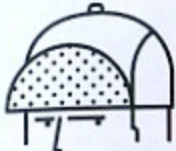
Nico189 (Mian, Italy)