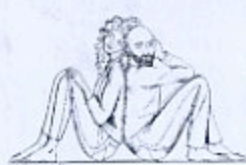
Suba Creative Studio Lluis Campmajo & Eio Lopez (Barcelona, Spain)