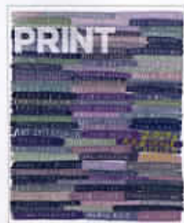
Cover by Debbie Millman

Print (445-120) is published quarterly, four issues per year, by F+W Media Inc., 10151 Carver Road, Suite 200, Cincinnati, OH 45242. Volume 71, Issue 4. Periodicals postage paid at Cincinnati, OH, and additional mailing offices. Postmaster: Send address changes to Print, P.O. Box 421751, Palm Coast, FL 32142. Printed in the U.S.A. Subscription rates: one year, U.S., $40; Canada, $55; international, $81.