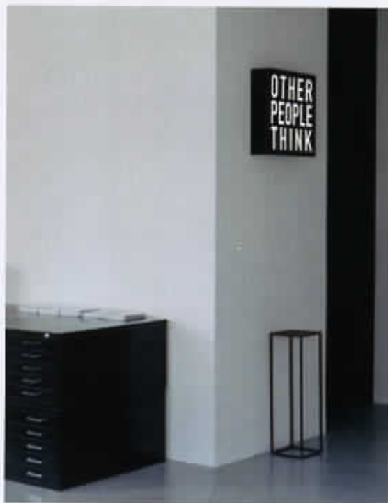
IN OTHER PEOPLE THINK 2012, BY ALFREDO JAAR. IN HIS NEW YORK STUDIO, SEE PAGE 098