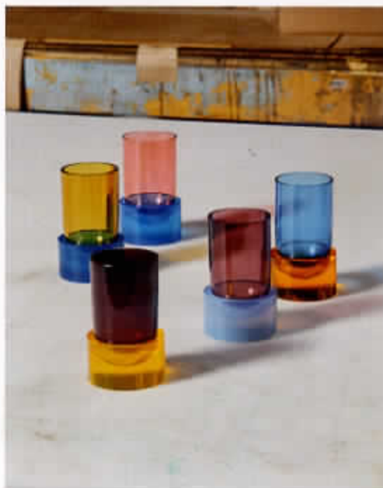
A FORAY INTO GLASS AND RESIN BY DESIGN STUDIO OBJECTS OF COMMON INTEREST. SEE PAGE 073