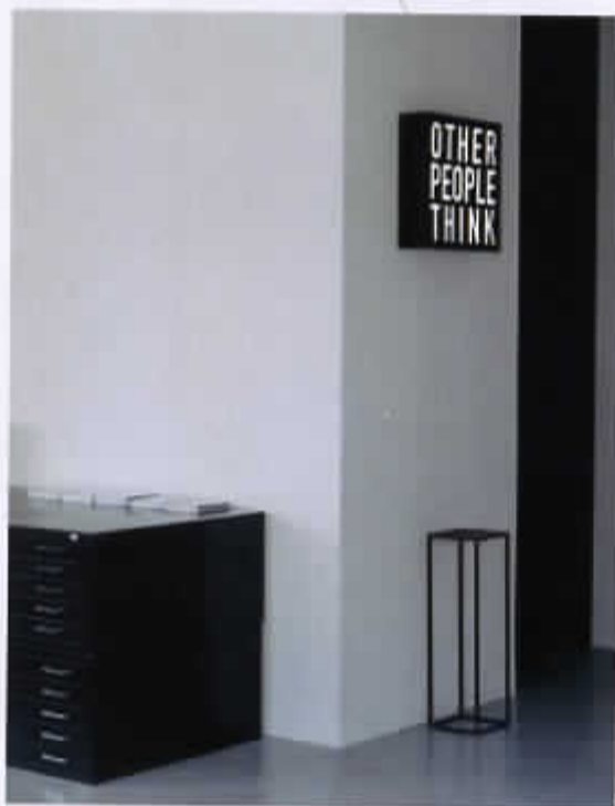
OTHER PEOPLE THINK 2012, BY ALFREDO JAAR, IN HIS NEW YORK STUDIO, SEE PAGE 098