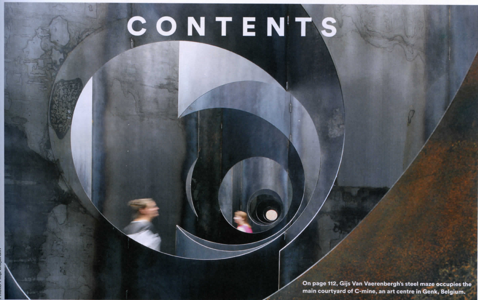
On page 112, Gijs Van Vaerenbergh's steel maze occupies the main courtyard of C-mine, an art centre in Genk, Belgium.