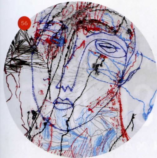
Clockwise from above: Ruko , detail, Alice Kettle, machine and digital stitch, 1.31 x 2.26 m, 2011; Predictive Dream , Aoki Katsuyo, porcelain, 2005; Domino Butterfly , Eley